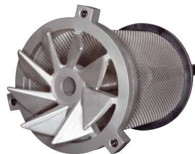
Inlet of strainer element

A common problem in many automatic self-cleaning strainers is inefficient backwashing due to debris lodged in the strainer element. The Model 2596 Strainer features Eaton's Cenpeller Technology which solves this problem. A unique vane plate is positioned at the inlet of the strainer element where it contacts the process media before it enters the element. The vane causes the incoming liquid to move in a circular motion, forcing the debris to lay up against the surface of the strainer element rather than impinging on the element and lodging in the element's openings. Lodged debris in the strainer element can negatively impact the differential pressure across the strainer, resulting in a shut down of the strainer while the element is manually cleaned. Cenpeller Technology in the Model 2596 Strainer helps prevent this problem while making backwashing much easier and more efficient.