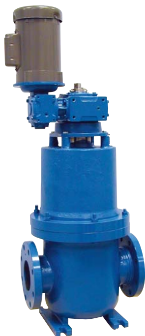
Model 2596 2", 3", and 4" Sizes