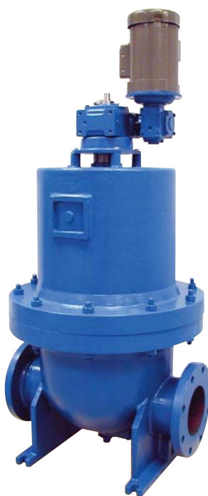
Model 2596 4"L, 6", and 8" Sizes

Eaton's Model 2596 Automatic Self-Cleaning Pipeline Strainers with Cenpeller™ Technology are now available in 2", 3", 4", 4"L, 6", and 8" pipeline sizes. A new size unit, the "4L", will cover applications where the combination of flow rate and open area requirements may make a standard 4" too small. These smaller size strainers incorporate all the improved design features currently available on the 10" through 48" size Model 2596 Strainers, and have a higher cleaning efficiency than the Model 596 strainers that they replace.